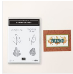
Caring Leaves Photopolymer Stamp Set (English) - 164273