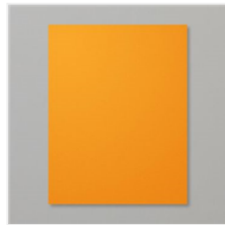
Pumpkin Pie 8-1/2" X 11" Cardstock - 105117