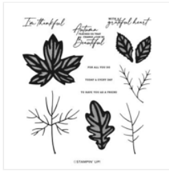
Autumn Leaves Photopolymer Stamp Set (English) - 162179

Jackie Beers jackie@jackiebeers.com Bluelinestamping.com