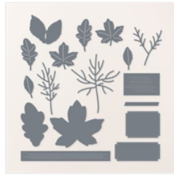
Autumn Leaves Dies - 162185