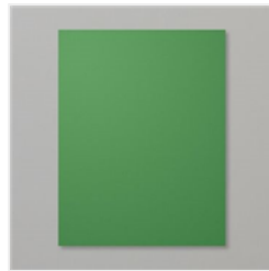
Garden Green 8- 1/2" X 11" Cardstock - 102584