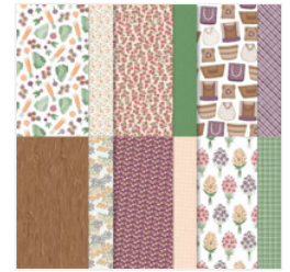
To Market 12" X 12" (30.5 X 30.5 Cm) Designer Series Paper - 163421