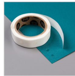
Mini Glue Dots - 103683