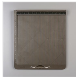
Simply Scored Scoring Tool - 122334