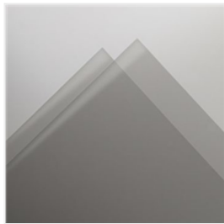
Window Sheets - 142314