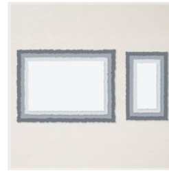
Deckled Rectangles Dies - 159173