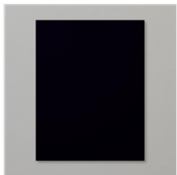
Basic Black 8-1/2" X 11" Cardstock - 121045