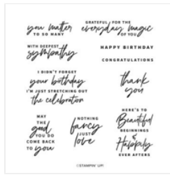
Something Fancy Cling Stamp Set (English) - 160416