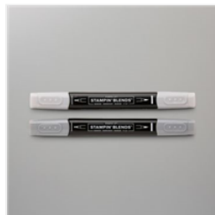
Smoky Slate Stampin' Blends Combo Pack - 154904