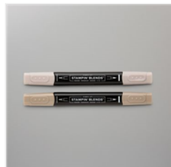
Crumb Cake Stampin' Blends Combo Pack - 154882