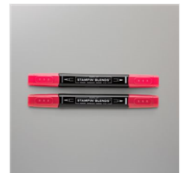
Real Red Stampin' Blends Combo Pack - 154899