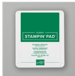
Shaded Spruce Classic Stampin' Pad - 147088