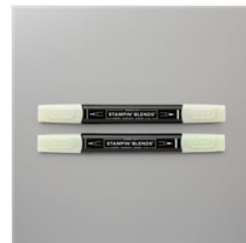
Soft Sea Foam Stampin' Blends Combo Pack - 154902