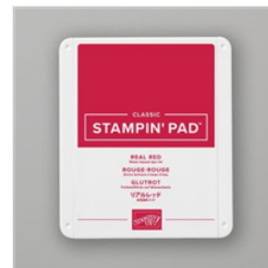
Real Red Classic Stampin' Pad - 147084