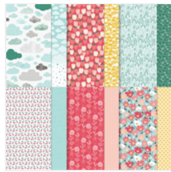
Sunny Days 12" X 12" (30.5 X 30.5 Cm) Designer Series Paper - 162974