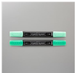
Shaded Spruce Stampin' Blends Combo Pack - 154903