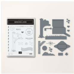
Sending Love Bundle (English) - 162880