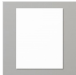
Basic White 8-1/2" X 11" Cardstock - 159276