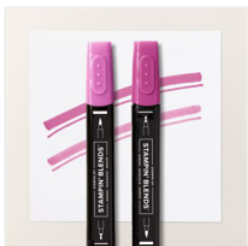
Berry Burst Stampin' Blends Combo Pack - 161681