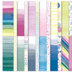
Bright & Beautiful 6" X 6" (15.2 X 15.2 Cm) Designer Series Paper - 161449