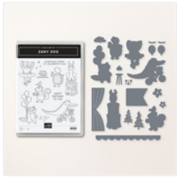
Zany Zoo Bundle (English) - 161315