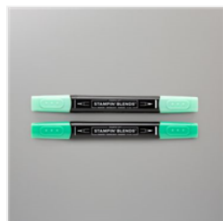
Shaded Spruce Stampin' Blends Combo Pack - 154903