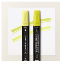
Lemon Lime Twist Stampin' Blends Combo Pack - 161682