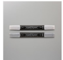
Smoky Slate Stampin' Blends Combo Pack - 154904