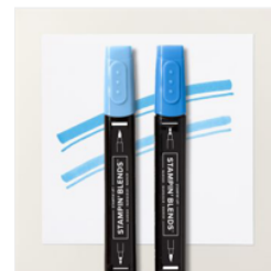
Azure Afternoon Stampin' Blends Combo Pack - 161672