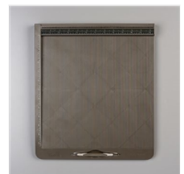
Simply Scored Scoring Tool - 122334