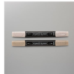
Crumb Cake Stampin' Blends Combo Pack - 154882