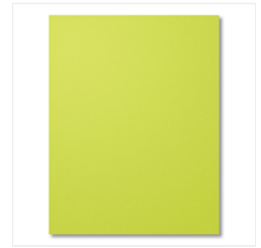
Lemon Lime Twist 8-1/2" X 11" Cardstock - 144245