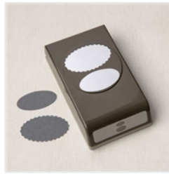
Double Oval Punch - 154242