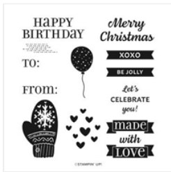
Celebrate With Tags Cling Stamp Set (English) - 159974

Jackie Beers jackie@jackiebeers.com Bluelinestamping.com