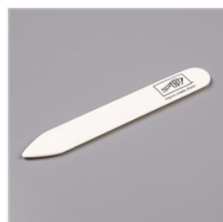
Bone Folder - 102300