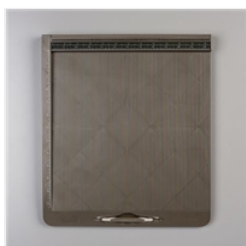
Simply Scored Scoring Tool - 122334