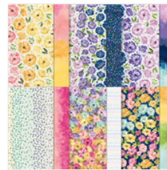
Hues Of Happiness 12" X 12" (30.5 X 30.5 Cm) Designer Series Paper - 158822