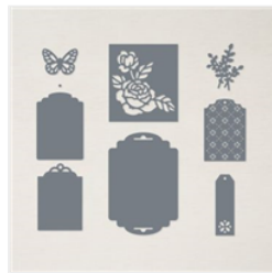
Designer Tags Dies - 159165