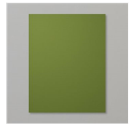
Mossy Meadow 8- 1/2" X 11" Cardstock - 133676