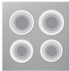
Layering Circles Dies - 151770