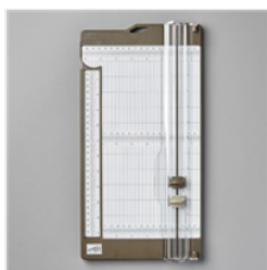
Paper Trimmer - 152392 Price: $25.00