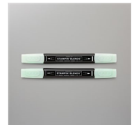
Mint Macaron Stampin' Blends Combo Pack - 154889 Price: $9.00