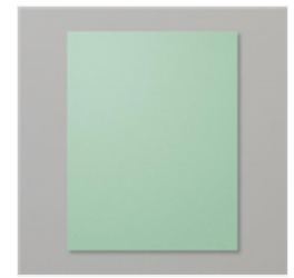
Mint Macaron 8- 1/2" X 11" Cardstock - 138337 Price: $8.75