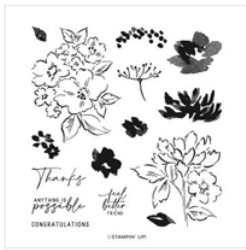
Hand-Penned Petals Photopolymer Stamp Set - 155070 Price: $22.00

Jackie Beers jackie@jackiebeers.com Bluelinestamping.com