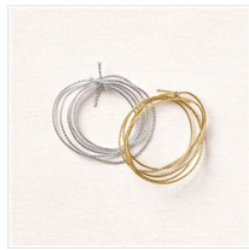
Simply Elegant Trim - 155766 Price: $7.50