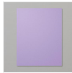
Highland Heather 8-1/2" X 11" Cardstock - 146986 Price: $8.75