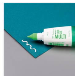
Multipurpose Liquid Glue - 110755 Price: $4.00