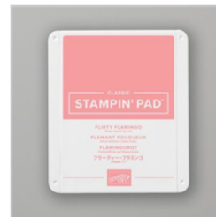
Flirty Flamingo Classic Stampin' Pad - 147052 Price: $7.50