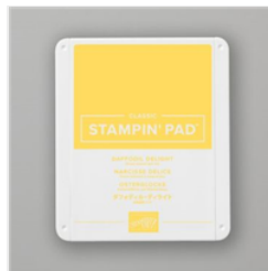
Daffodil Delight Classic Stampin' Pad - 147094 Price: $7.50